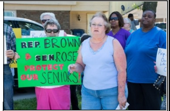
IARA members and home caregivers with SEIU protest in front of state lawmakers' offices in Champaign.

IARA members have mobilized across the state to call on Governor Rauner and the Illinois General Assembly to enact a fully funded, yearlong budget that preserves critical services for seniors, children and families.