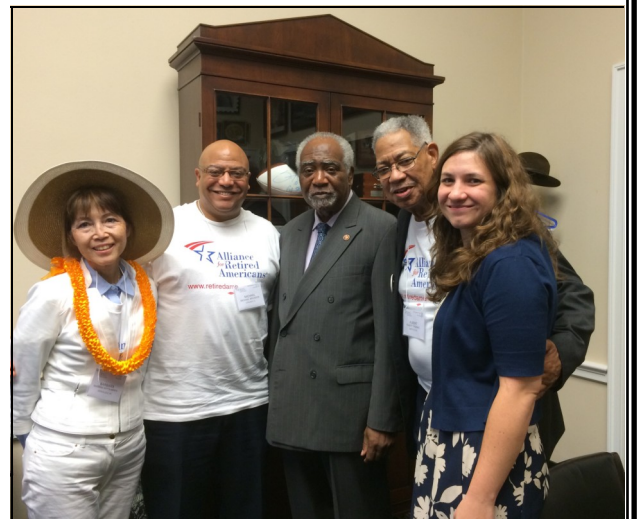
IARA's delegation with Congressman Danny K. Davis during a lobby visit on Capitol Hill.