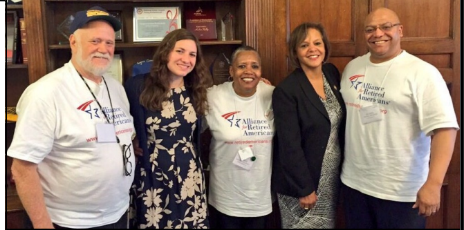
IARA's delegation with Congresswoman Robin Kelly during a lobby visit on Capitol Hill.

(7th District) and Congresswoman Robin Kelly (2nd District) met with members of their district in person on the need to protect and strengthen Social Security, Medicare and Medicaid. IARA members also spoke with their elected officials on their concerns about the Trans Pacific Partnership and how the trade pact could impact seniors.