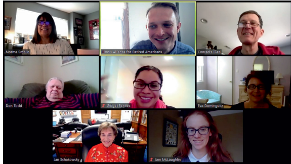
IARA retiree leaders meet with Congresswoman Jan Schakowsky (IL-9)