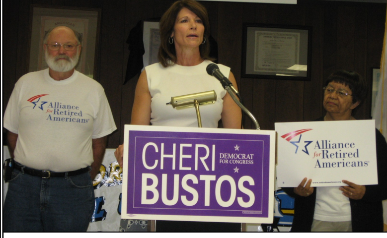
Alliance members stand beside Congresswoman Cheri Bustos at a Social Security anniversary celebration in Rock Island.

This year, the Alliance looks forward to celebrating the 80th anniversary of Social Security and continuing to protect and strengthen this important program.