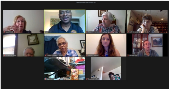
IARA Executive Board and staff meet with Rep. Welch on Zoom

Fellow IARA retiree leaders, I hope you're in good health & taking good care. Though this year has brought challenges that none of us could have predicted, I'm proud of our organization & each of our members who have demonstrated a truly remarkable resilience.