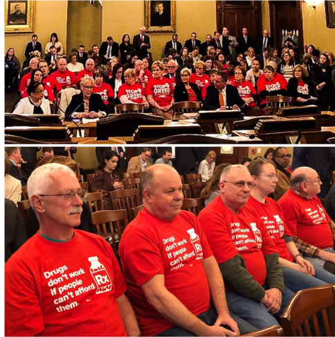
Retiree leaders pack a hearing in support of the prescription drug affordability board in Springfield in March