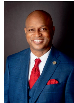
Jerry Prete Award Recipient Illinois House of Representatives Speaker Emanuel "Chris" Welch

Watch the full 2021 Senior Power Celebration at: tinyurl.com/seniorpower21